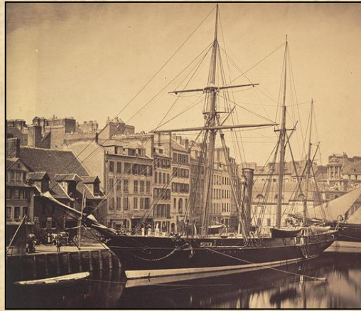
Above, a slip at Le Havre circa 1835.